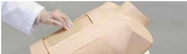
Identification of "Larrey's point" (left xiphisternal junction) for needle insertion